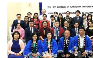
General Conference of Kanazawa University Overseas Alumni Associations

Kanazawa University appoints alumni who work as academic staff at overseas universities to the post of Collaborative Professor (CP). Currently, more than 160 CPs are working with the university at its overseas bases, providing support to Japanese students studying abroad, and recruiting international students. There is a virtuous cycle of international students who have studied at Kanazawa University serving as CPs after graduation, and helping the university attract international students.