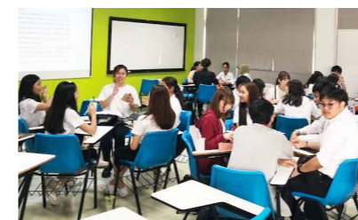
Study Abroad First Step Program conducted in Thailand

Many of the students who have participated in these short-term programs have become interested in studying abroad for longer periods. As a result, a growing number of students are going abroad on a longer-term basis through such programs as the Outbound Student Exchange Program to study at one of the international partner universities for at least three months, research programs at overseas universities, and the TOBITATE! Young Ambassador Program.